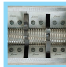
SG-24 Teeth Cutters